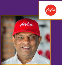
Tan Sri Tony Fernandes CEO, AirAsia Group