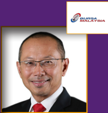
Tan Sri Abdul Wahid Omar Chairman, Bursa Malaysia Berhad